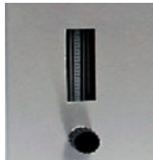
MFFT 10 with analog flow meter